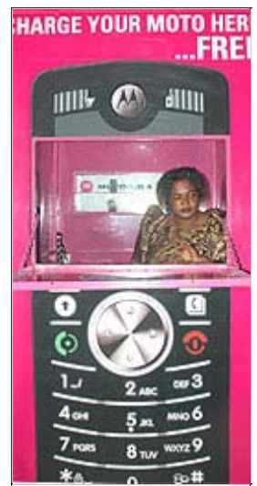
BUSINESS: The moto kiosk.

The kiosks will offer free, solar-powered mobile phone recharge services for up to 20 phones simultaneously and also act as a phone booth with user-friendly prices.