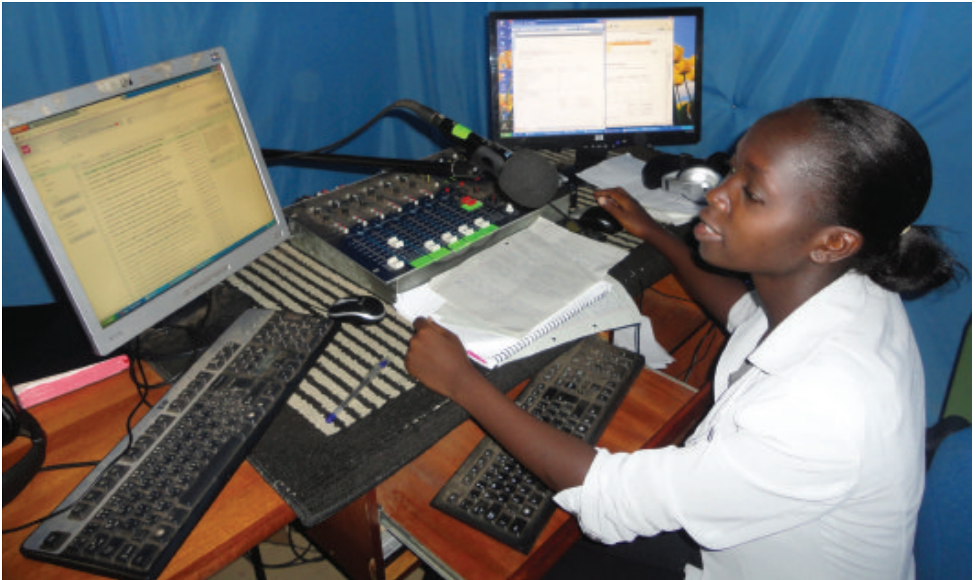
FrontlineSMS:Radio Nam LolweFM