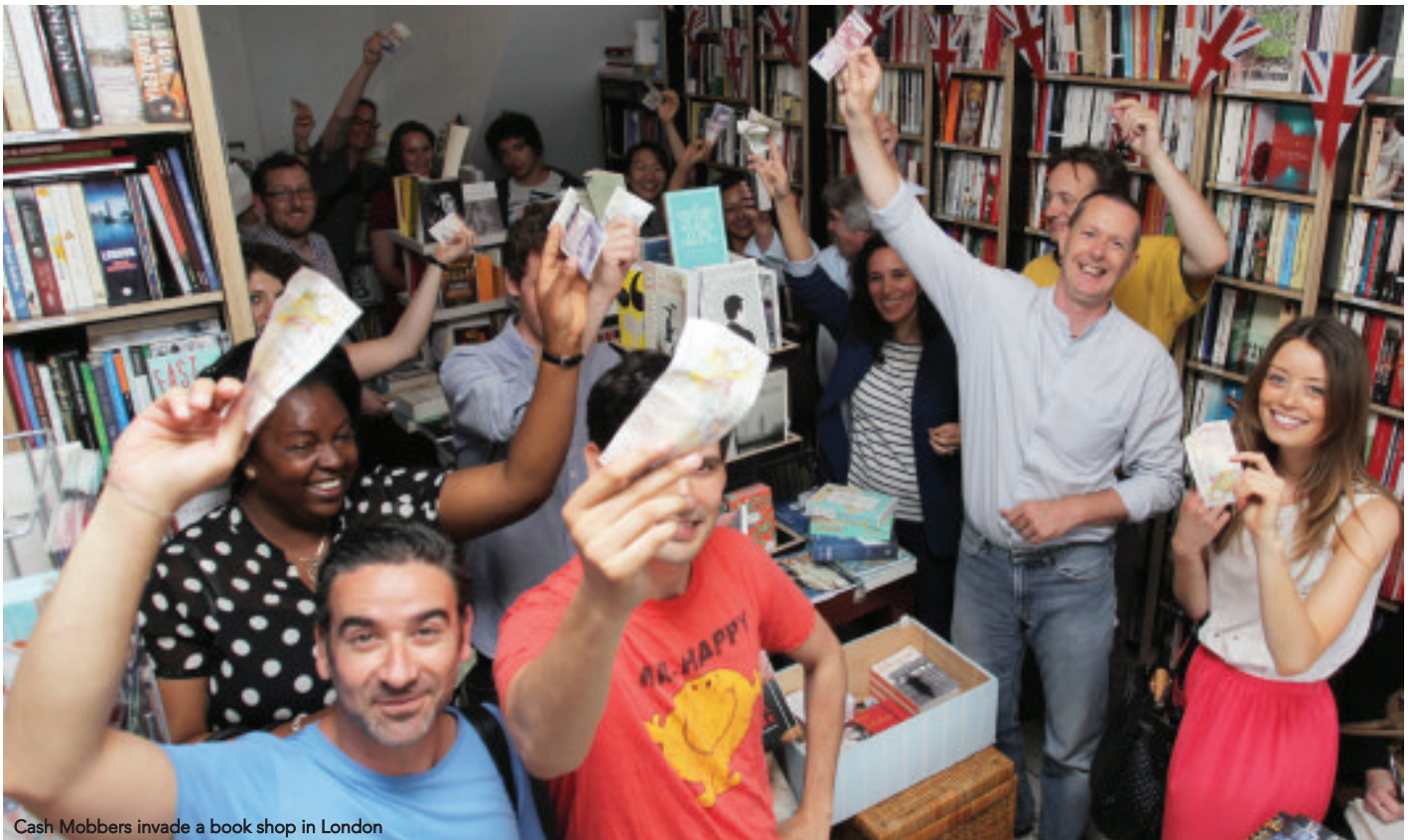
Cash Mobbers invade a book shop in London