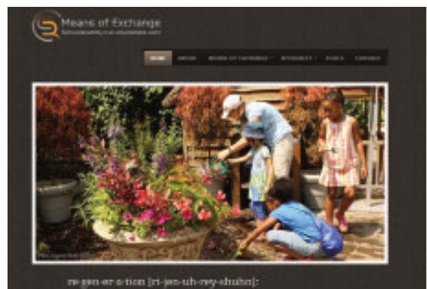
Means of Exchange website

“Means of Exchange will aim to build about a dozen tools and applications. In terms of timing it's perfect because today people are more receptive to alternatives. If you're concerned about seeing your local shops and pubs shut, or think, 'well maybe I could be useful to my neighbours', Means of Exchange is a place you can go to remake those connections – but you have to be driven to action in the first place. The idea is you go to the website, connect and share. One more key objective is to reach those who aren't engaged, which is why it has to be fun. It's 'how do you get people to do things which as a side effect are more useful to your community?' You make it social, you use social media. The preachy bit is secondary to the social activity and that's what I think many organisations are missing. They're making you feel bad and guilt-making doesn't work any more – that's often seen as a problem with much of the green agenda.”